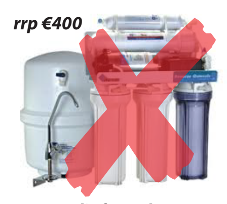
museum relic from the 1970's

the most advanced filtering ever developed highest water quality - double the filtration of any RO