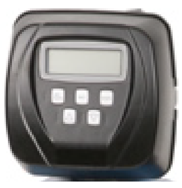
the latest technology

1> least advanced 2> short life 3> noisiest 4> high cost salt use 5> €high annual service