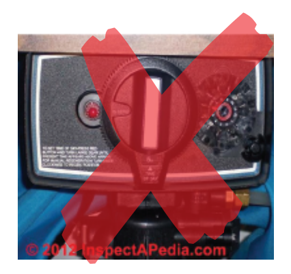
no change from 1950's

most advanced control ever developed highest diagnostics, jam/freeze protection